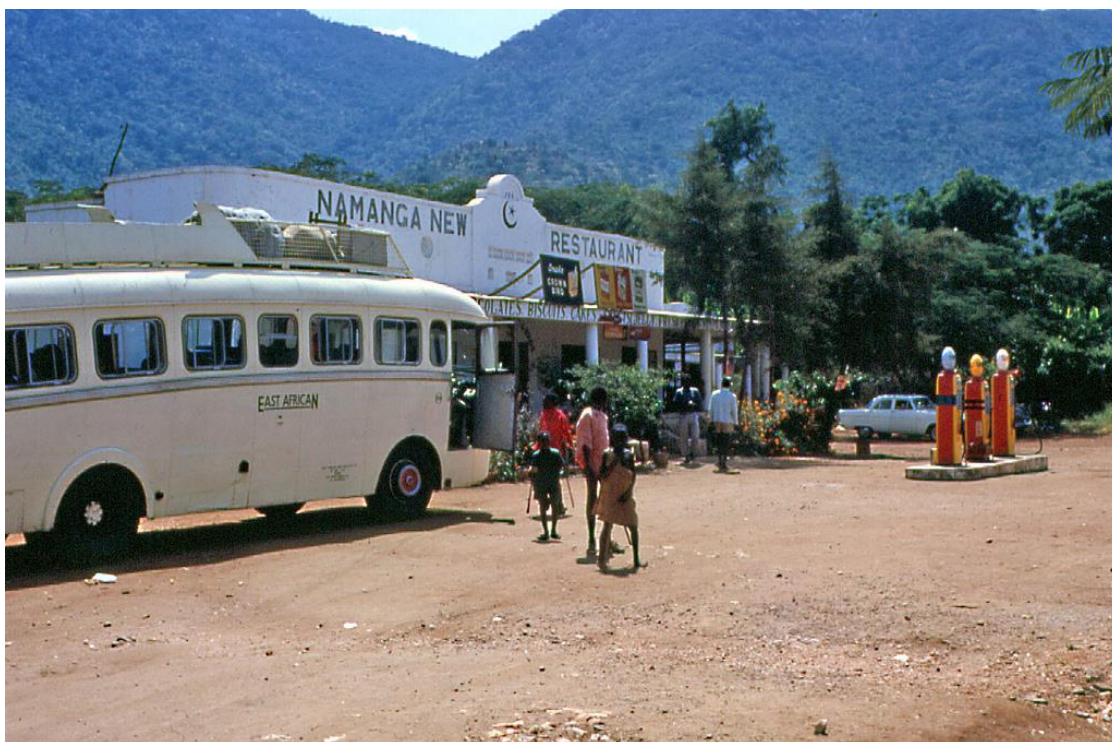
Namanga in 1960. Photo shows a restaurant belonging to a Muslim Memon well remembered by my late father-in-law.